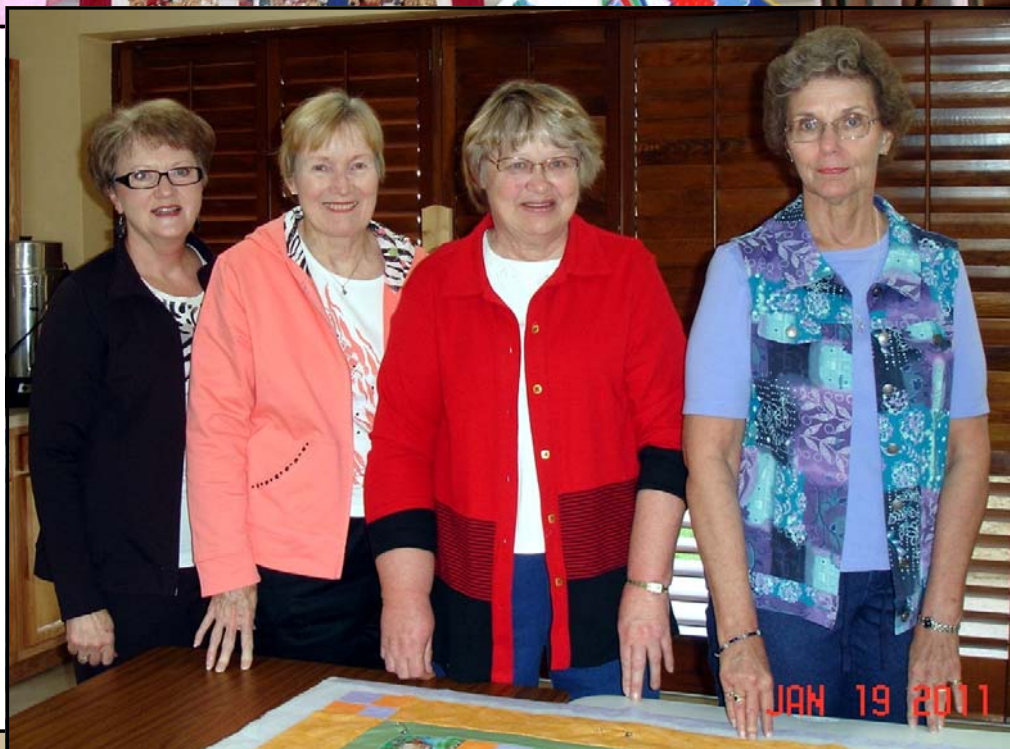
Below: Greenfield Village Sew N Sews